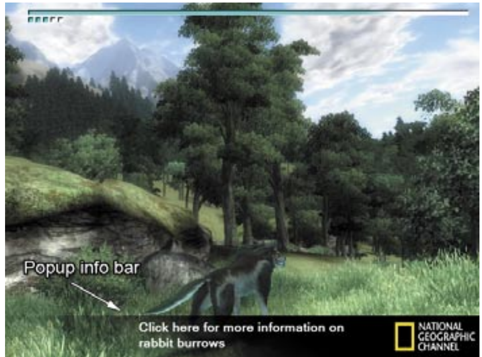
Gameplay Mockup ( Copyrighted material used: Zelda, Oblivion )

Wolves seeks to teach the player about the life of a wolf and about nature in general. Wolves are often perceived as vicious killers. This game can teach players that wolves kill only because they must, and they will usually avoid confrontation if possible. In addition, through a serachable bestiary, the player will learn about the feeding, living, and hibernation patterns of many different types of prey and predators. Overall, Wolves will give the player a much deeper understanding of the ecosystem in which wolves live in much the same way that a game like Sim City gives the player a better understanding of urban development.